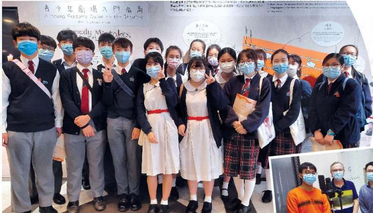
54 students watching the show "A Comedy of Mistakes" at Sai Wan Ho Auditorium