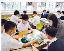
Students playing a game of Scrabble in an S2 class