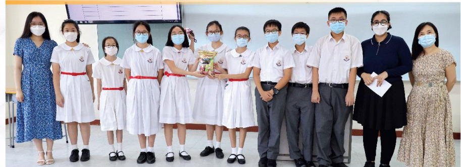
Winners of the drama performance