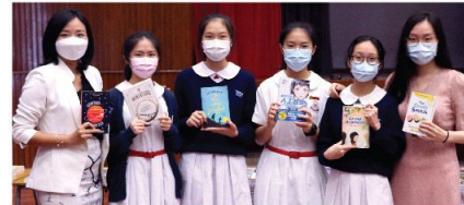
A book fair is held annually at the school hall in order to promote reading culture. The exhibitor provides high quality books for our teachers and students to read. Reading brings happiness to our students.

Our library aims at providing a favourable reading environment during and outside class time to cultivate students' reading interests and habits. Hence, there are different kinds of reading activities provided to all our students.