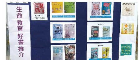
Different book theme exhibitions are set up on the ground floor and in the library. In order to encourage students to borrow more books, a lucky draw is conducted for those borrowers.