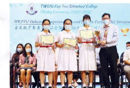
Our debaters won second place in S3 and S5 Divisions, third place in S2 Division, and fourth place in S1 Division at the HKPTU Secondary Debating Competition