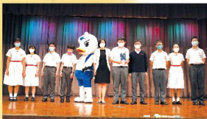
Film-makers accepting the award for the Best Motion Picture with the festival mascot, Seagull