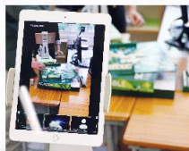
Cross border students, taking part in Scrabble through Zoom