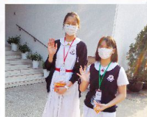
English Ambassadors greeting schoolmates at the entrance