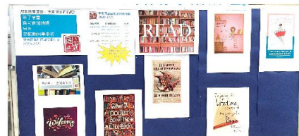
Our Reading Scheme promotes and raises students' interest in reading. Prizes are given to those students who meet the requirements of the scheme.