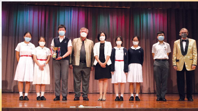
Senior and Junior Winning Teams – Blue House