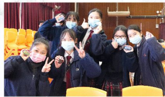
S6 girls showing off their rock paintings