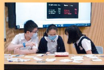
Debaters discussing their rebuttal during an inter-house debate